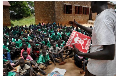
MRE session.