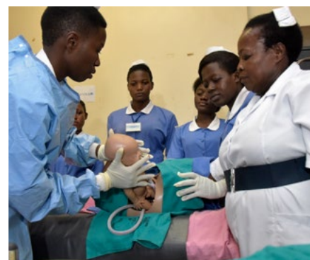
Women studying to become midwives at Mulago School of Nursing and Midwifery.