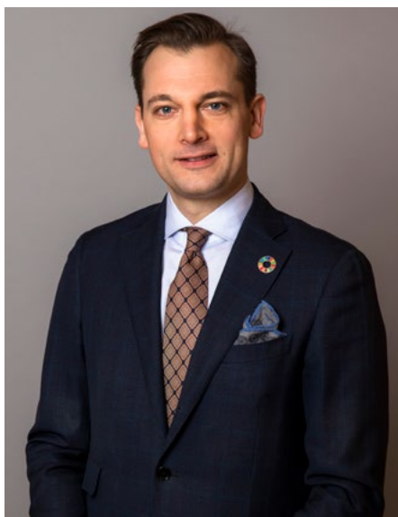
Minister for International Development Cooperation Per Olsson Fridh

"There is overwhelming evidence that gender equality boosts economic growth. Despite this, trade policy today benefits men more than women. We need to step up efforts to ensure that trade policy and trade promotion activities benefit women and men equally."