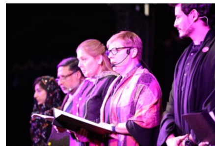
The play Seven performed in Pakistan.

The Swedish Foreign Service has also taken several initiatives to mobilise support for gender equality and all women's and girls' full enjoyment of human rights. Some of these initiatives have covered the entire spectrum of issues (such as the Stockholm Forum on Gender Equality below), while others have addressed subsidiary issues (such as #midwives4all and SheDecides below).