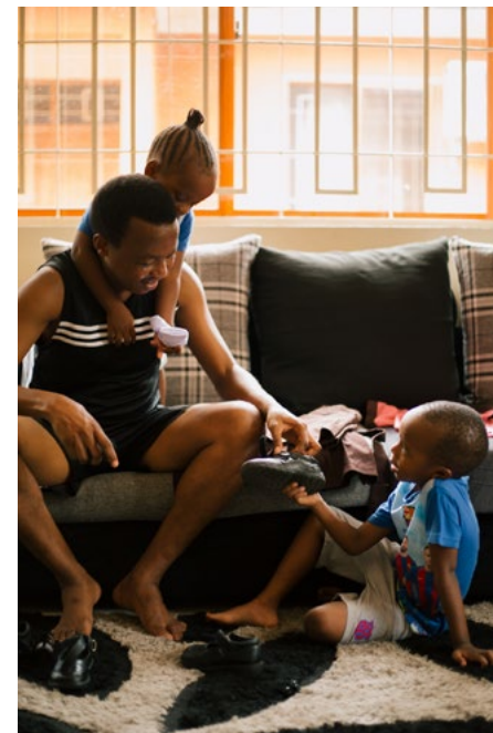
Photo from the local photo competition, Tanzanian dads .

The Swedish Embassy in Athens has carried out a number of activities within the cultural sector, including a three-day tribute to the role of women in film-making and to the role of film for gender equality. Broad discussions have also included issues relating to parental leave and other measures of significance for a gender equal society.