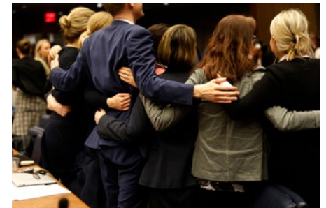
Concluding ceremony at the 63rd Commission on Status of Women, March 2019.

The 250th anniversary of the Swedish Freedom of the Press Act was observed with an international seminar with and for women in journalism and associated industries, with a focus on the harassment they encounter. Sweden continues to support the safety of women journalists through the Fojo Media Institute, and provides project support for a pilot study on establishing a centre to support journalists who are subjected to online hate, with a particular focus on women journalists.