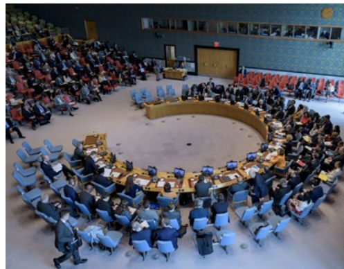
Security Council meeting on UN peacekeeping operations and women in peacekeeping, April 2019.