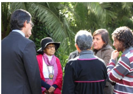
In connection with International Human Rights Day 2017, the Swedish Embassy in Mexico hosted a seminar on the gender perspective of the protection of journalists and human rights defenders.