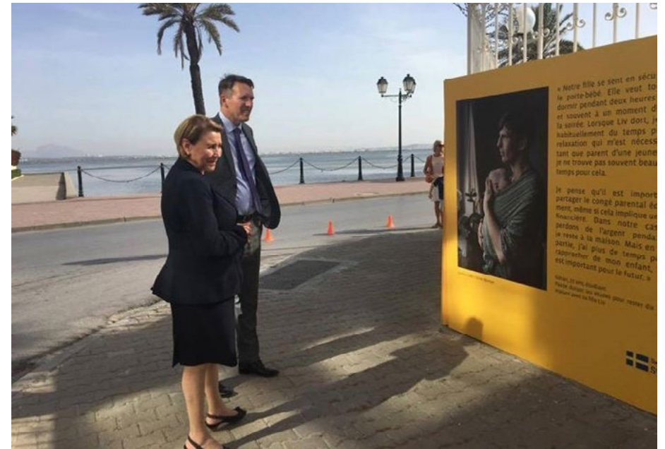
Sweden's missions around the world were asked to share their views on how Sweden's feminist foreign policy can be implemented. Here Sweden's former Ambassador to Tunisia, Fredrik Florén, and Tunisian Minister Neziha Laabidi, responsible for women's rights and gender equality.