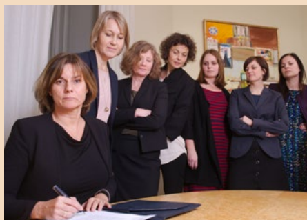
Minister for the Environment and Climate, and Deputy Prime Minister Isabella Lövin signs the Government proposal for a new Climate Act