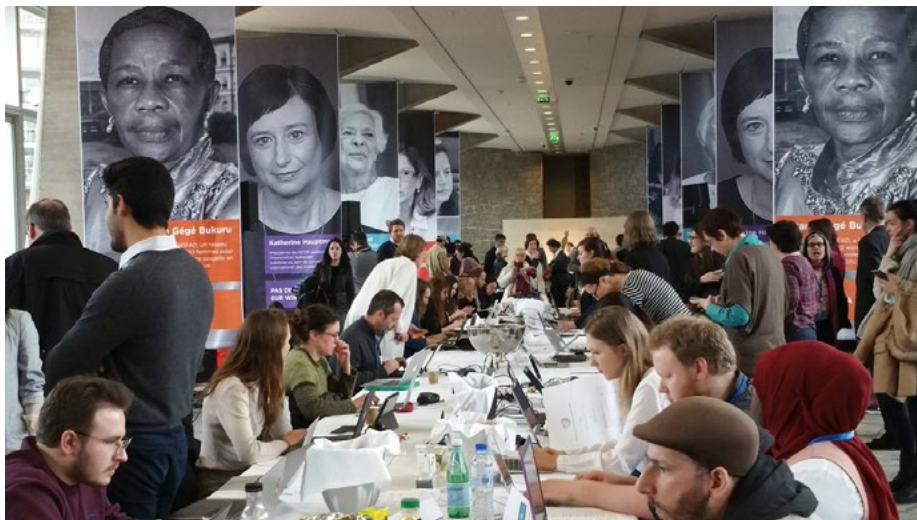
Photo from the Wikigap event at Sweden's Permanent Delegation to UNESCO in Paris on International Women's Day in 2018.

The in-depth work has borne fruit, both externally and internally. Below is a selection of examples on how missions abroad work systematically with the feminist foreign policy using various methods. Other examples can be found elsewhere in this handbook and in the collection of examples for the first three years' implementation of the policy. 48