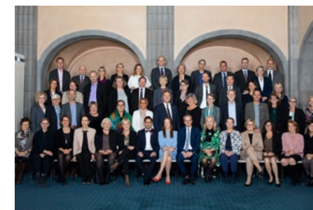
Meeting on Gender Mainstreaming in Government Agencies (JiM) with Director Generals of Swedish Government Agencies that participates in the JiM-programme, October 2019. The meeting was headed by Swedish Minister for Gender Equality, the Minister for Social Security, and the Minister for Home Affairs.

Sweden regularly tops rankings of the world's gender equality – from the European Institute for Gender Equality's (EIGE) ranking of gender equality in the EU to the World Economic Forum's (WEF) Global Gender Gap. This demonstrates that Sweden's policy has been successful in many ways when it comes to promoting gender equality, but significant challenges still remain.