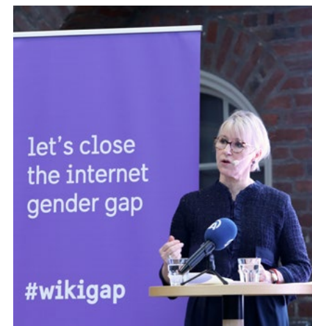
Former Swedish Minister For Foreign Affairs [2014-2019] Margot Wallström speaking at Wikigap in Stockholm.