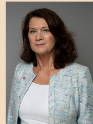
Ann Linde Minister for Foreign Affairs