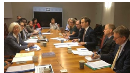
Swedish consultations on gender with the World Bank, September 2019.

Sweden champions gender equality work in multilateral organisations by being an active donor and board member. For example, Sweden is the biggest donor to UN Women and is also a major donor to UNFPA. Sweden has also played a leading role in drawing up gender equality strategies for the development banks, including the World Bank, the African Development Bank, the European Bank for Reconstruction and Development, and the European Investment Bank.