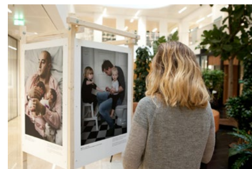
Opening of the photo exhibition Swedish Dads by Johan Bävman at the Epicenter Amsterdam.

The exhibition has been developed into an important tool in the Swedish Foreign Service’s work to encourage new approaches and values. It has been displayed at Swedish embassies in around 50 countries, and more exhibitions are planned. (For more information, see chapter 6.)