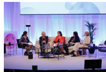
The Stockholm Forum on Gender Equality was held on 15–17 April 2018 and gathered more than 700 participants from over 100 countries and a multitude of sectors and functions.