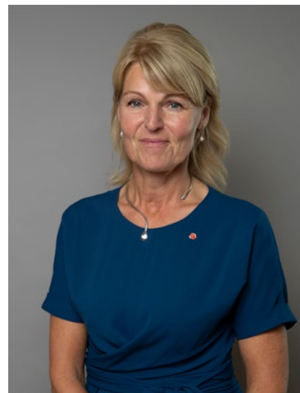
Minister for Foreign Trade with responsibility for Nordic Affairs Anna Hallberg

"There is overwhelming evidence that gender equality boosts economic growth. Despite this, trade policy today benefits men more than women. We need to step up efforts to ensure that trade policy and trade promotion activities benefit women and men equally."