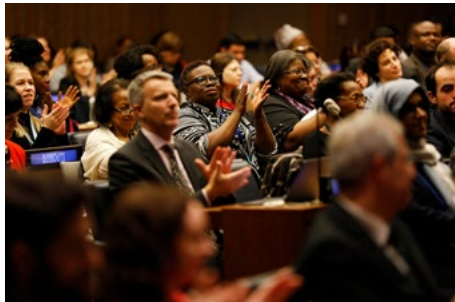
Concluding ceremony at the 63rd Commission on the Status of Women, March 2019.