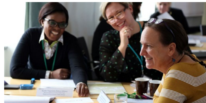
Discussions at Sida with international and Swedish CSO's on SRHR and religion.

Aid efforts are carried out within all objective areas for the Swedish feminist foreign policy. This includes support to strengthen countries' legislation for women's and girls' rights, to promote women's economic empowerment, to combat men's violence against women, to strengthen women's roles in peace processes and to increase women's political participation and access to SRHR.