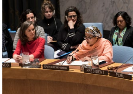
Deputy UN Secretary-General Amina Mohammed at Security Council addressing the issue of preventing sexual violence in conflict, April 2018.

In a UN context, work with women, peace and security is driven forward in continuous dialogue between Stockholm, the Permanent Mission of Sweden to the UN and other relevant missions abroad. One consistent experience from the dialogue with international organisations is that impact increases significantly if there is access to new data and arguments for why the gender equality perspective is needed and which concrete measures should be taken for strengthened integration.