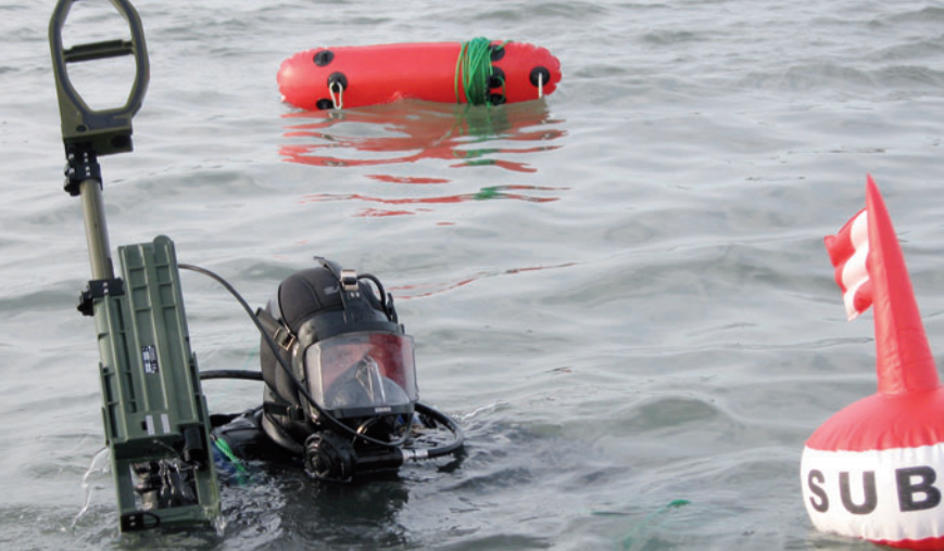
Underwater clearance operations | Poti harbour, Georgia

However, locating, removing and destroying these underwater hazards create challenges. Good quality and reliable diving equipment is necessary, and demining equipment must be adapted for underwater use. Other factors to consider include diving time, visibility, temperature, diving depth and the strength of the current. The harder the conditions, the more advanced the training needs to be.