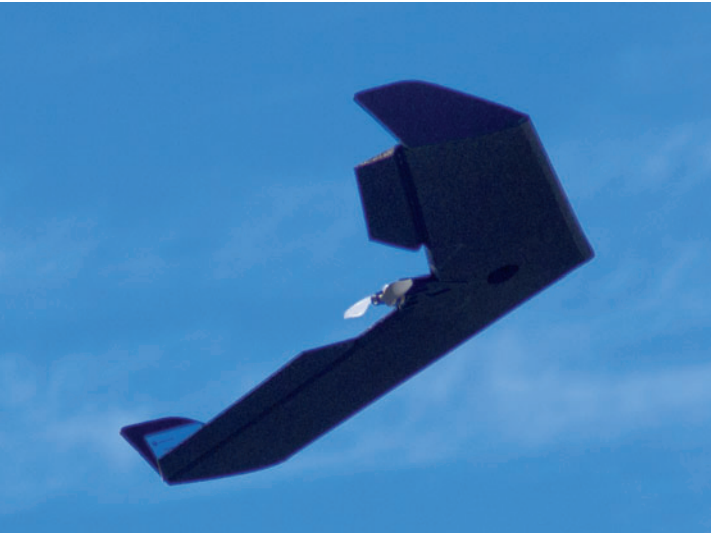
Photos from UAVs could provide a cheaper and more precise option than satellite images to map the extent of minefields.