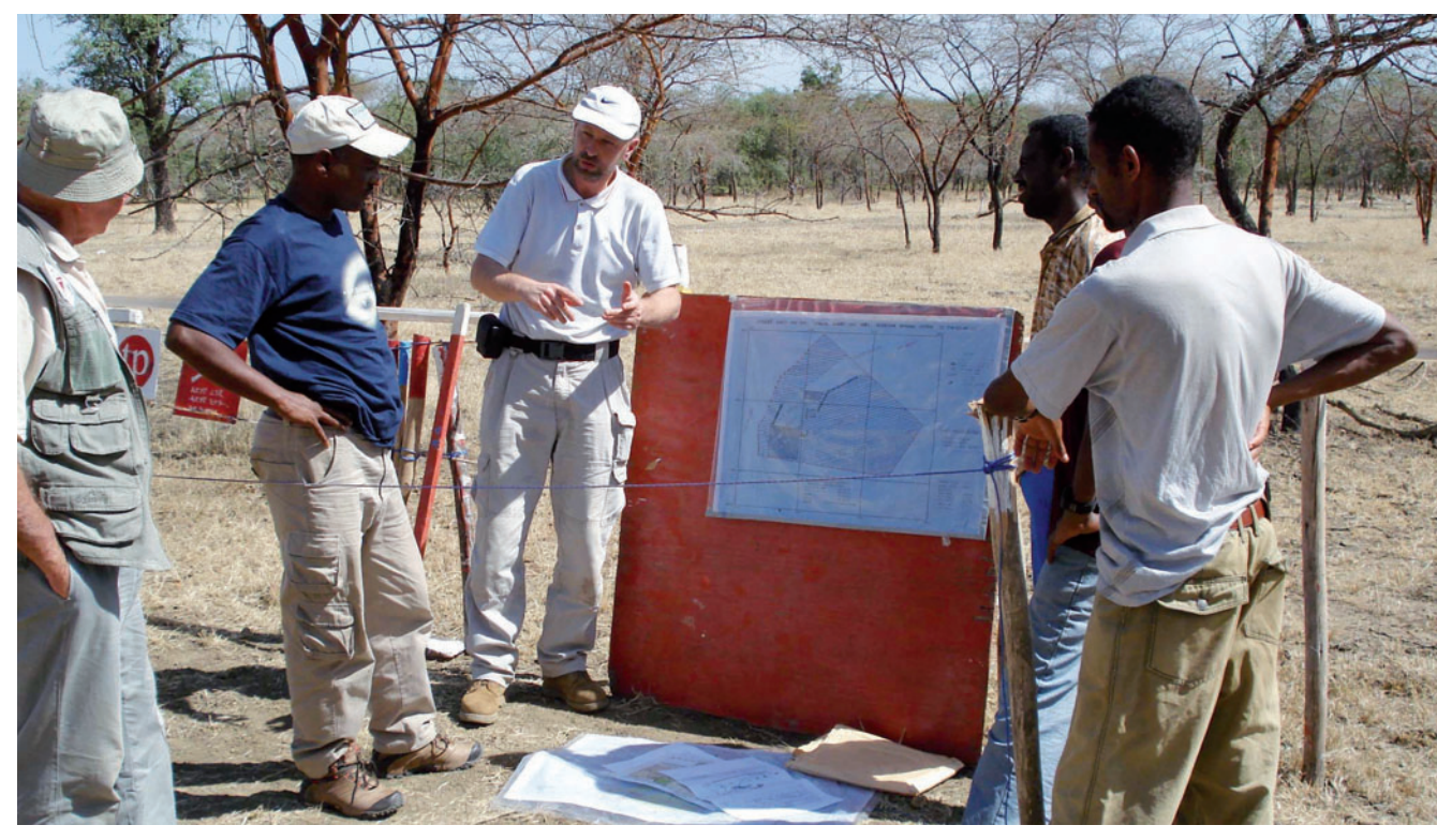
Demining site briefing | Ethiopia

Our aim is to help national and local authorities in mineaffected countries to plan, coordinate, implement, monitor and evaluate safe mine action programmes, so that they function as effectively and efficiently as possible