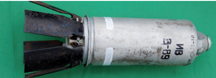
Cluster munitions contain large numbers of submunitions.