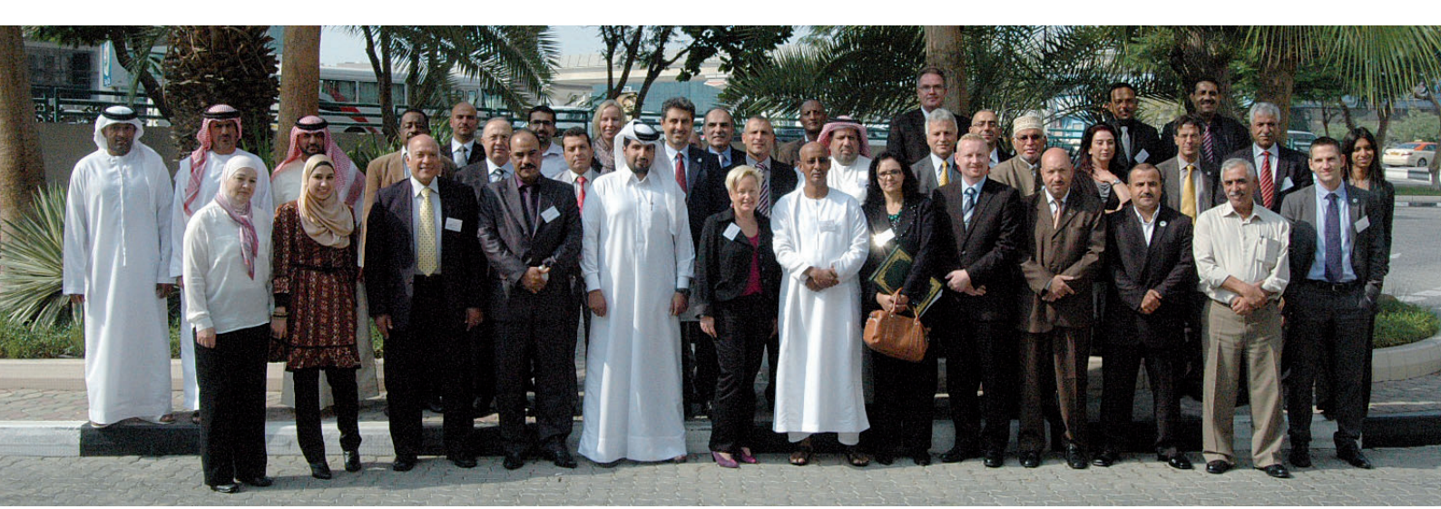
Participants of the first workshop of the Arabic-language Outreach Programme for Mine Action in Dubai | United Arab Emirates

For this reason, the GICHD organised a three-day conference to launch the Arabic-language Outreach Programme (AOP) for Mine Action in Dubai, United Arab Emirates in November 2012. It was an important occasion, gathering together 40 participants from these countries to discuss mine action challenges and identify their needs. Representatives of national mine action programmes, international and non-governmental organisations, research centres, militaries and commercial operators took part.