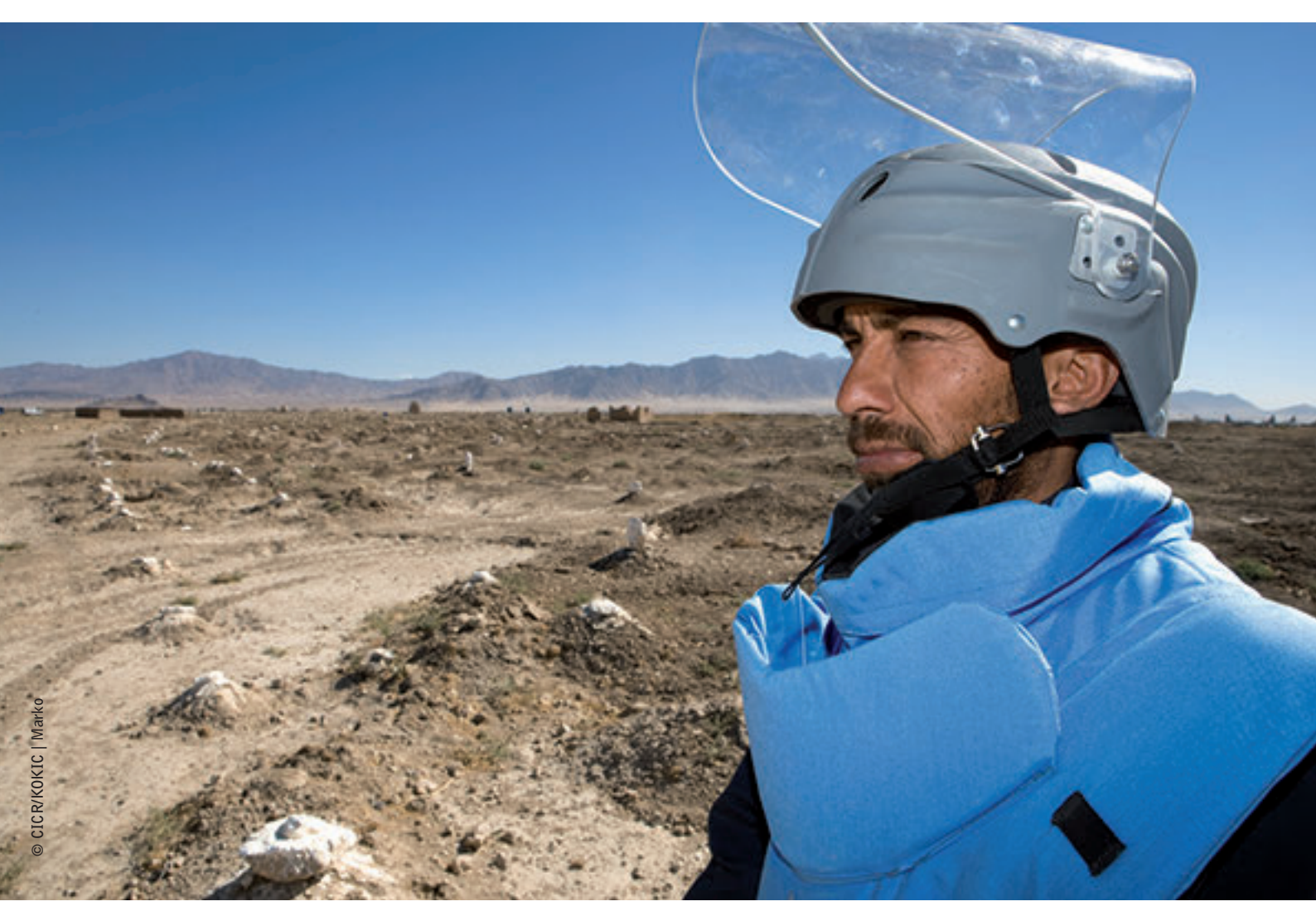
Demining operations near Bagram air base | Afghanistan

MACCA now intends to build upon this success by delivering Dari-language workshops annually for mine action organisations and government departments, non-governmental organisations and other groups.