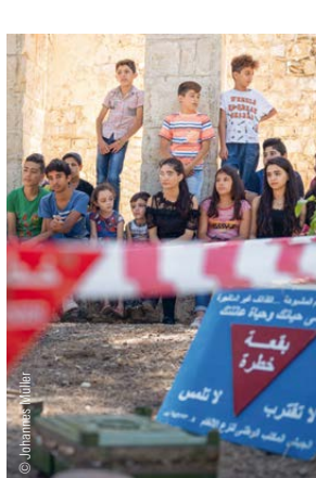
REDUCING RISK FROM EXPLOSIVE ORDNANCE MAKING COMMUNITIES SAFE