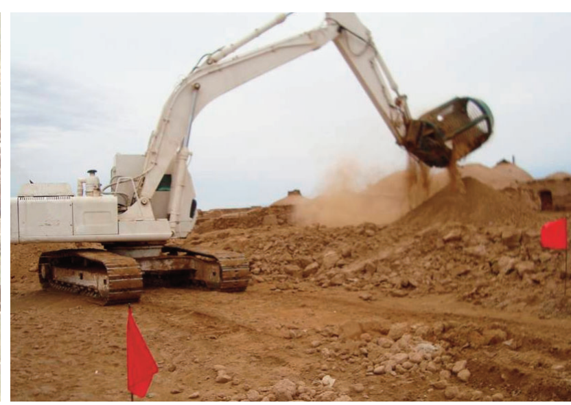
After Demining machine, in the same village, inspecting hazardous debris and, in the process, destroying physical borders between properties, which resulted in land disputes, due to the absence of owners and written land records.

In response to these potential risks, mine action organisations in Afghanistan have developed engagement criteria which stipulate that land disputes