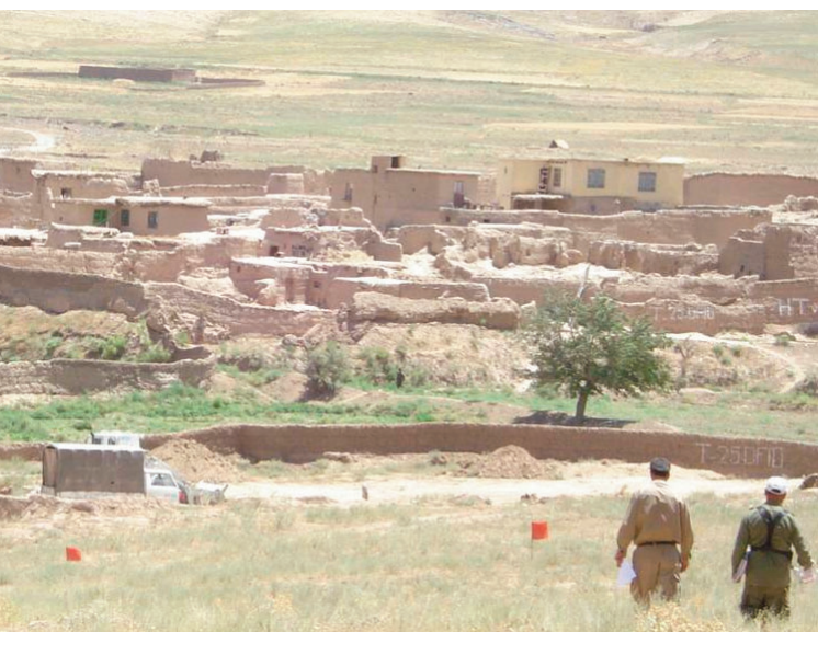
Before Mine-contaminated village in Kohsan District | Herat Province | Afghanistan. Most villagers had fled due to the conflict.

must be adequately resolved before they begin to clear contaminated land. While these organisations do not take an active role in the resolution of the disputes, or the development of new land management systems, they try to ensure that tensions will not be inflamed because of the release of previously