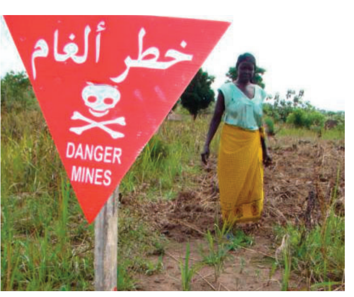
Recently returned refugee cultivating her land, suspected to be contaminated, in Yei, Southern Sudan.

Female headed households can be more vulnerable to land grabbing as they are more likely to be illiterate, poorer, have fewer livelihood options, and are often less knowledgeable about their land rights than male headed households. They may also have limited or no land inheritance rights under customary or even statutory law. Therefore, they may be less able to defend their land claims. Such patterns were identified explicitly in Afghanistan and South Sudan, but are no doubt present, with variations, in most war-torn countries affected by mines and ERW. The processes of community participation, planning, prioritisation, land release and handover, and post clearance monitoring and evaluation all need to take into account female headed households' specific needs and vulnerabilities.