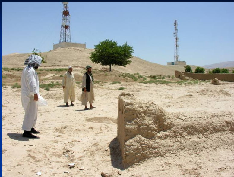
Landmines and livelihoods: Kabul February 2011