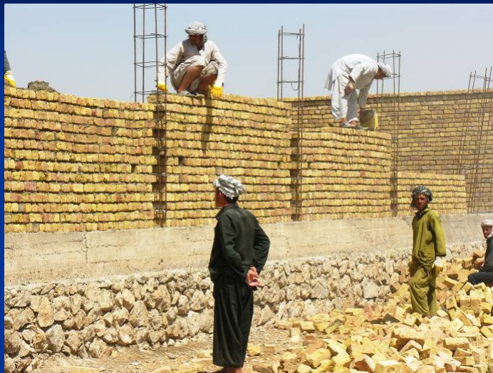
Landmines and livelihoods: Kabul February 2011