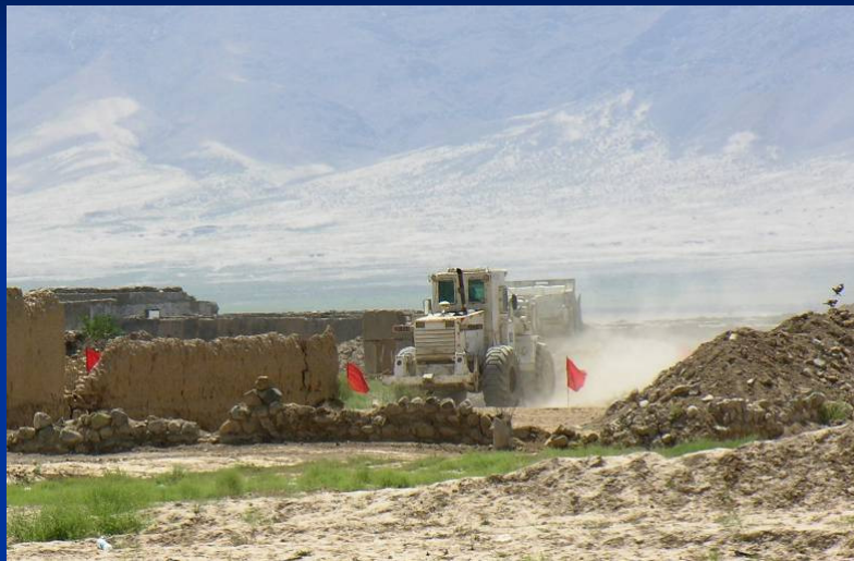
Landmines and livelihoods: Kabul February 2011