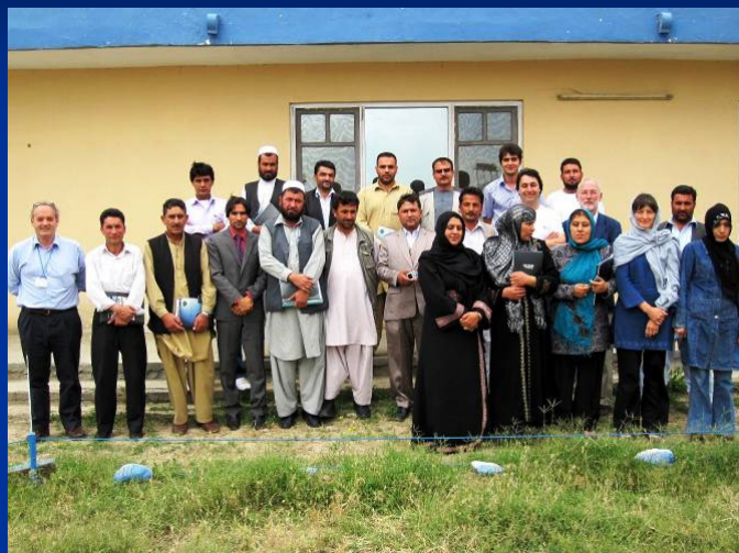
Landmines and livelihoods: Kabul February 2011

Team formation: 4 teams of 5 people each (social scientist, LIAT, IP man and woman, driver) + DMC + MACCA