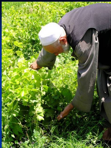
Rabat: grapes on demined land

Landmines and livelihoods: Kabul February 2011