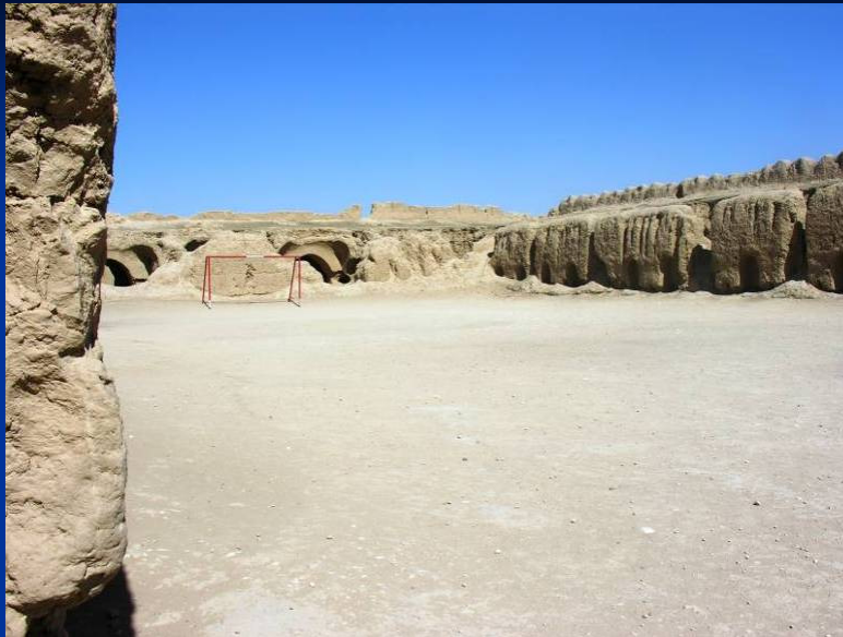
Landmines and livelihoods: Kabul February 2011