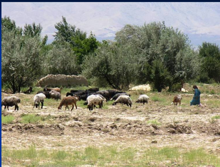
Landmines and livelihoods: Kabul February 2011