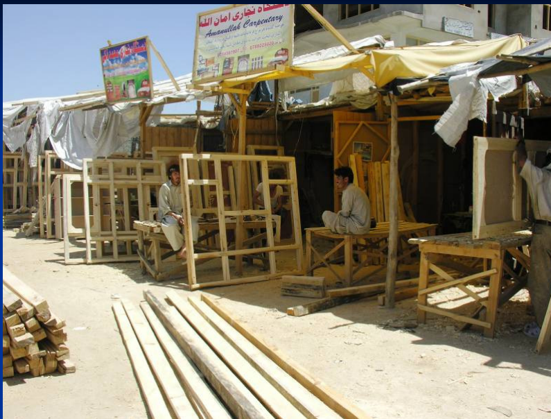
Landmines and livelihoods: Kabul February 2011