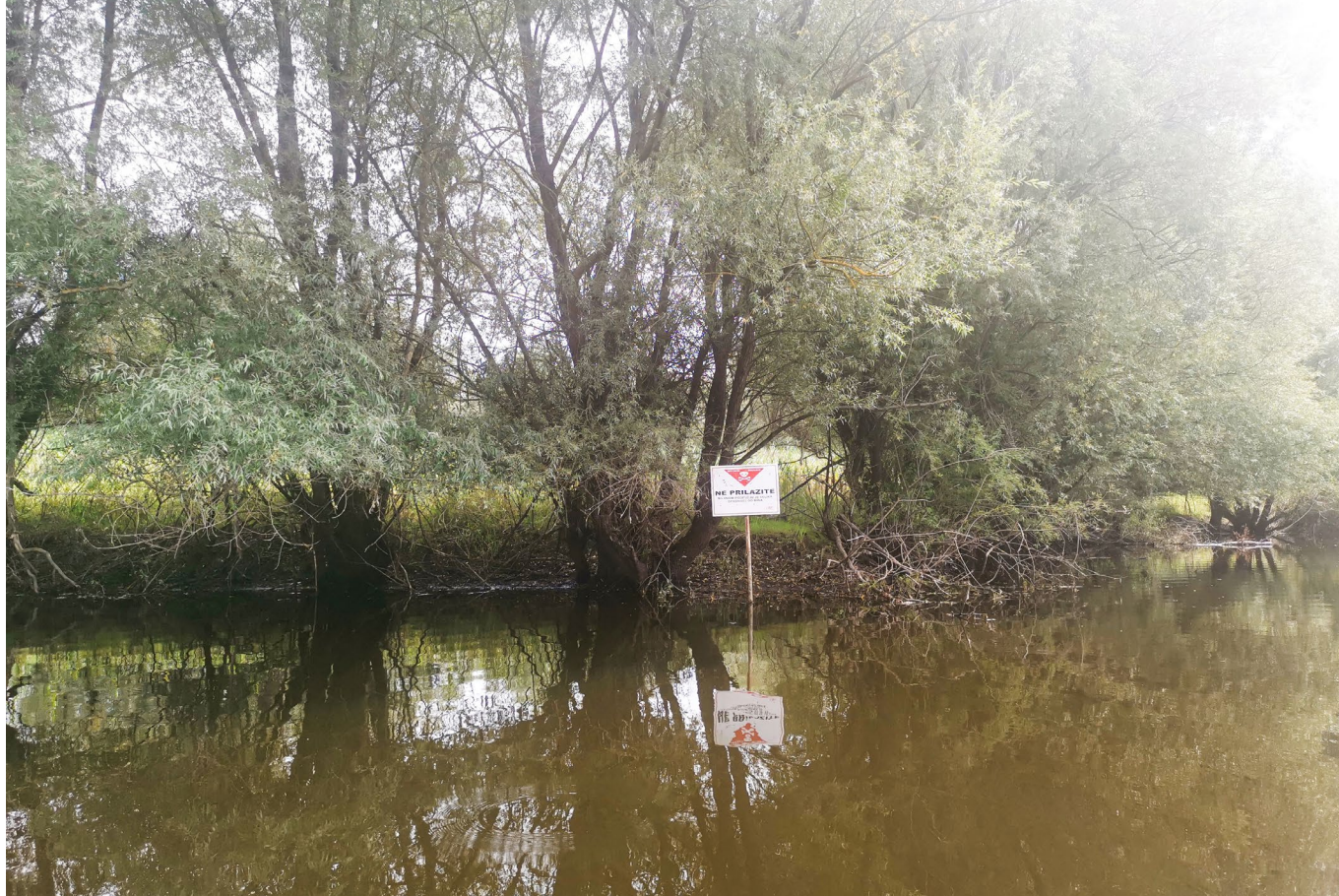
A marked confirmed hazardous area in Croatia.