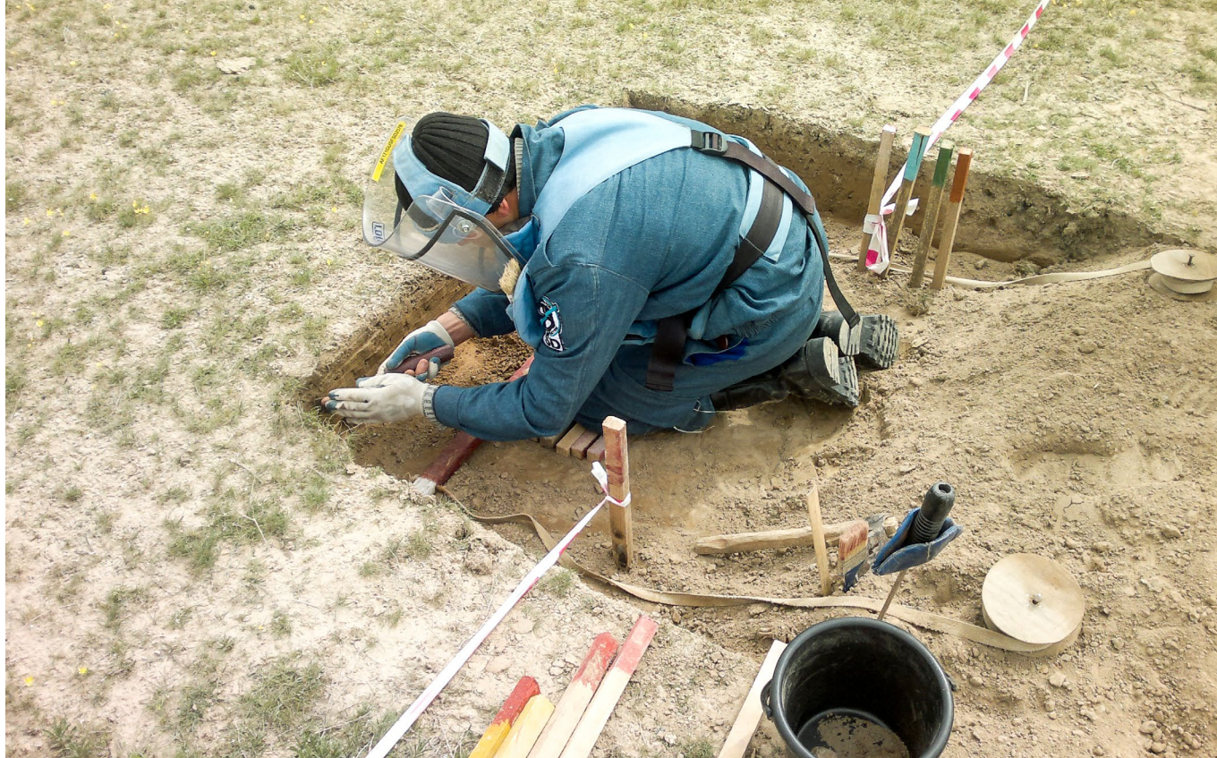
Deminer at work in Tajikistan.