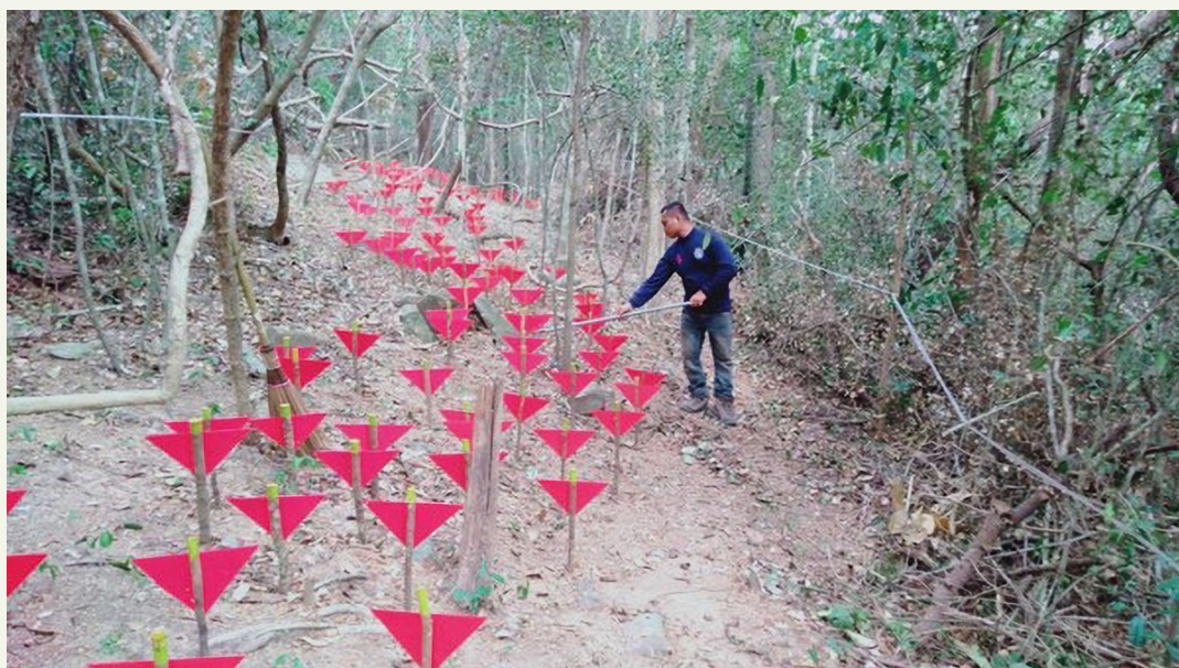
A dense anti-personnel minefield on the Thai-Cambodian border.

The highest values for this KPI are in Western Sahara, Serbia and Croatia, with 4,524, 6,782, and 10,897 square metres, respectively. More detailed analysis of this KPI in annex A looks at the relationship between the number of mines found at a task site and the area cleared per item. It shows that, as the number of mines at a site increases, the number of square metres cleared per item decreases, likely owing to the concentration of mines in pattern or barrier minefields, which makes it easier for land release decision-makers to clear the area confidently. Nevertheless, this relationship could also be affected by other factors, such as incorrect contamination mapping. For example, during the present study the Serbian Mine Action Centre reported that the country was discovering previously unknown mine-contaminated areas. In these areas, the mines had not been laid in specific patterns, making the demining efforts more difficult, as the survey results could be subject to change, and the overall situation more complex. In any case, individual countries and sites should be studied in more detail with a view to understanding this relationship more fully.