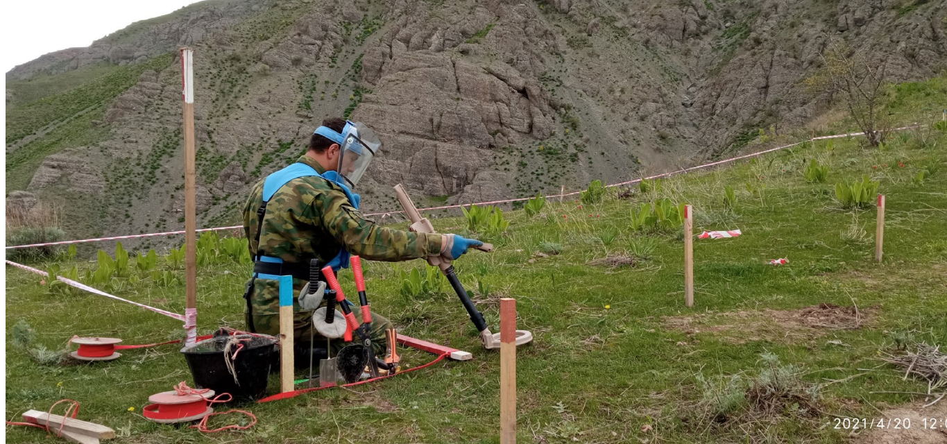
An average deminer in Tajikistan clears 25 square metres per day in difficult terrain.