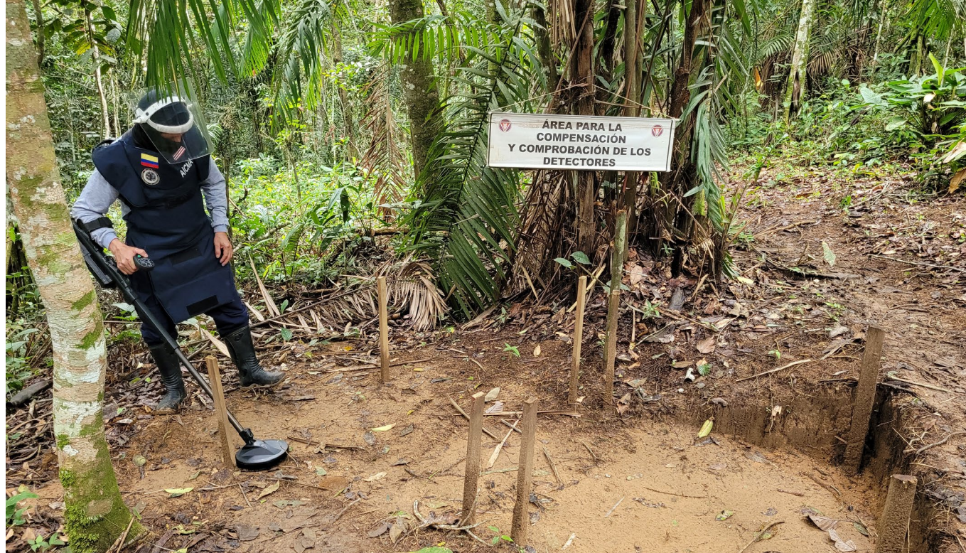
Quality management processes as applied to land release operations at work in Colombia.

The study's recommendations are as follows: