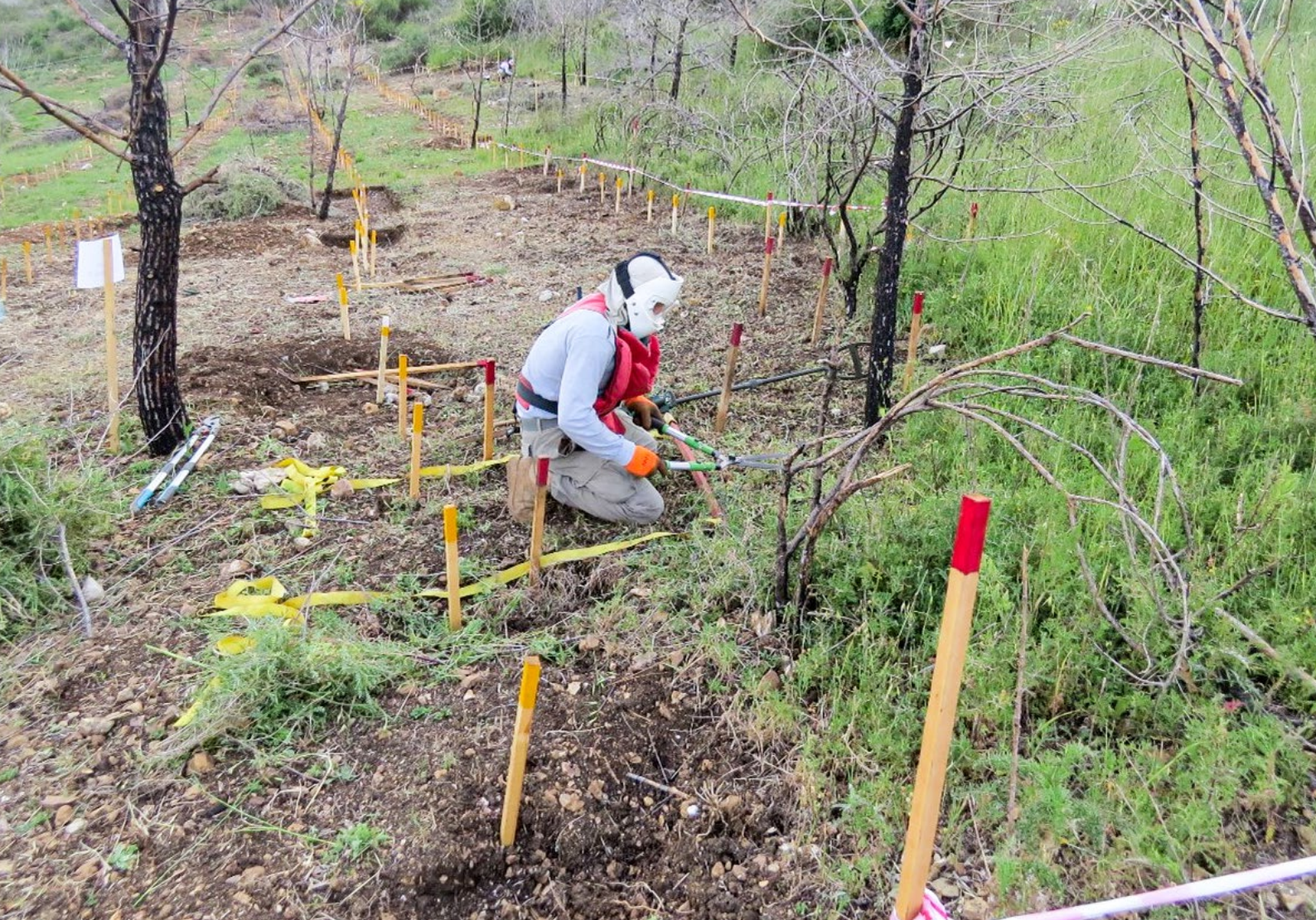
A border anti-personnel minefield in Lebanon.