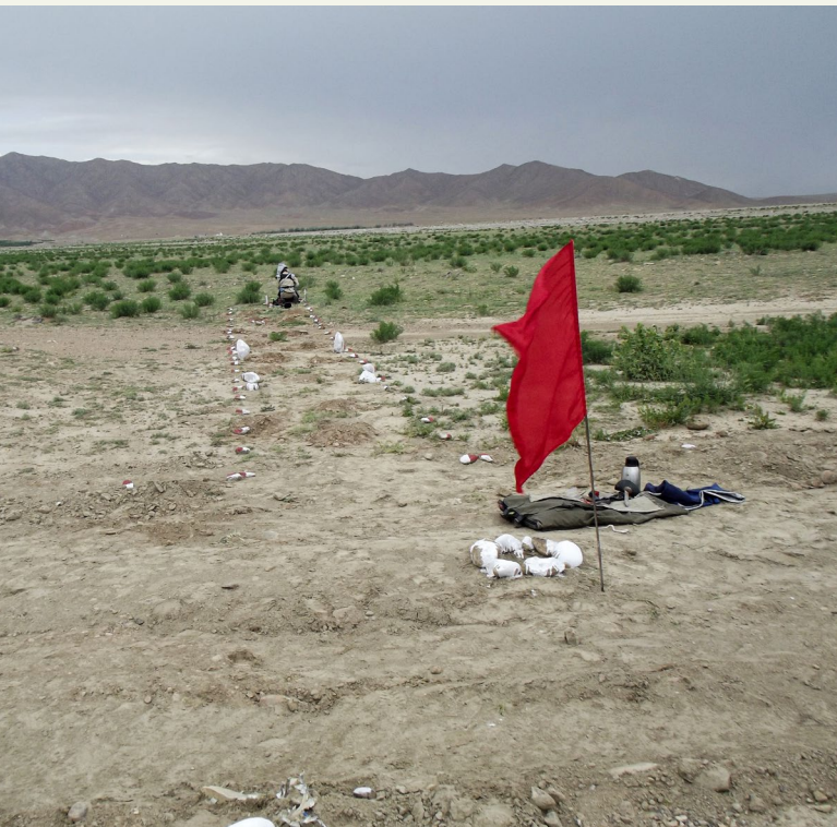
An anti-vehicle minefield in Logar Province in Afghanistan, where there are large suspected hazardous areas in remote locations, with little historical record of the minelaying and thus challenges associated with the availability of data.