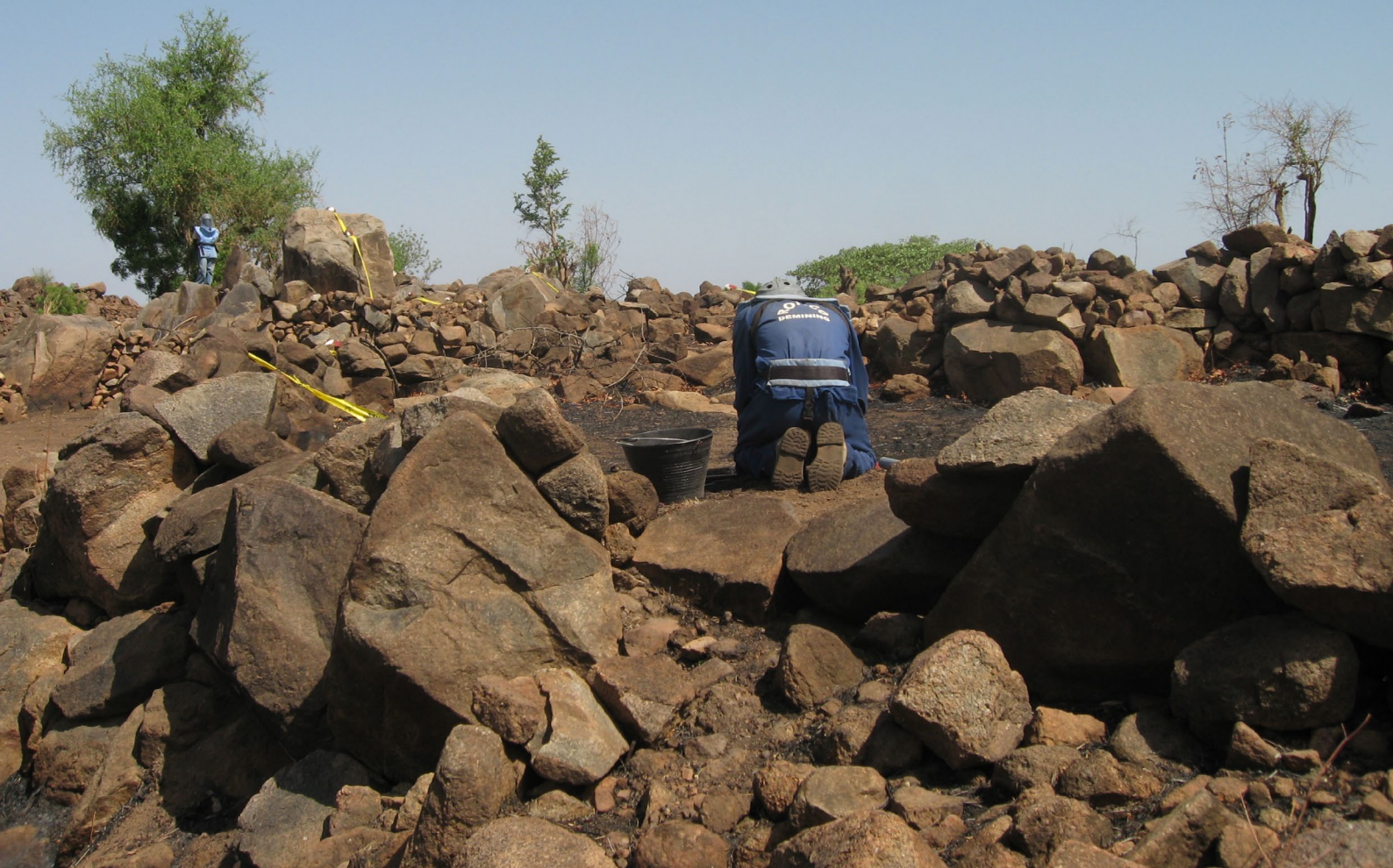
Rocky, difficult terrain in Sudan.

The countries with the highest values for this KPI are Colombia, Lebanon and Sudan, with $ 47, $ 5.87, and $ 2.89 per square metre of land released, respectively. The extremely high value for Colombia could be due to the extreme challenges associated with its remote, hard-to-access and heavily vegetated task sites and the hard-to-detect nature of much of the home-made explosive ordnance. Colombia has known one of the longest and most intense armed conflicts in the world, in which there was the widespread use of landmines and other explosive ordnance. The value may also be explained by the dispersed nature of much of the contamination. Additionally, the peace process in Colombia is relatively new, and, as such, a mine action sector is still in the process of being established. This has required significant investment in infrastructure, capacity-building and technical assistance. Over the period under review, there was a noticeable downward trend in terms of the cost and an increase in the land released through clearance; the cost per square metre of land released decreased from $ 79 in 2017 to $ 20 in 2019, potentially owing to improvements in survey quality and a focus on ensuring the efficiency and effectiveness of land release operations.